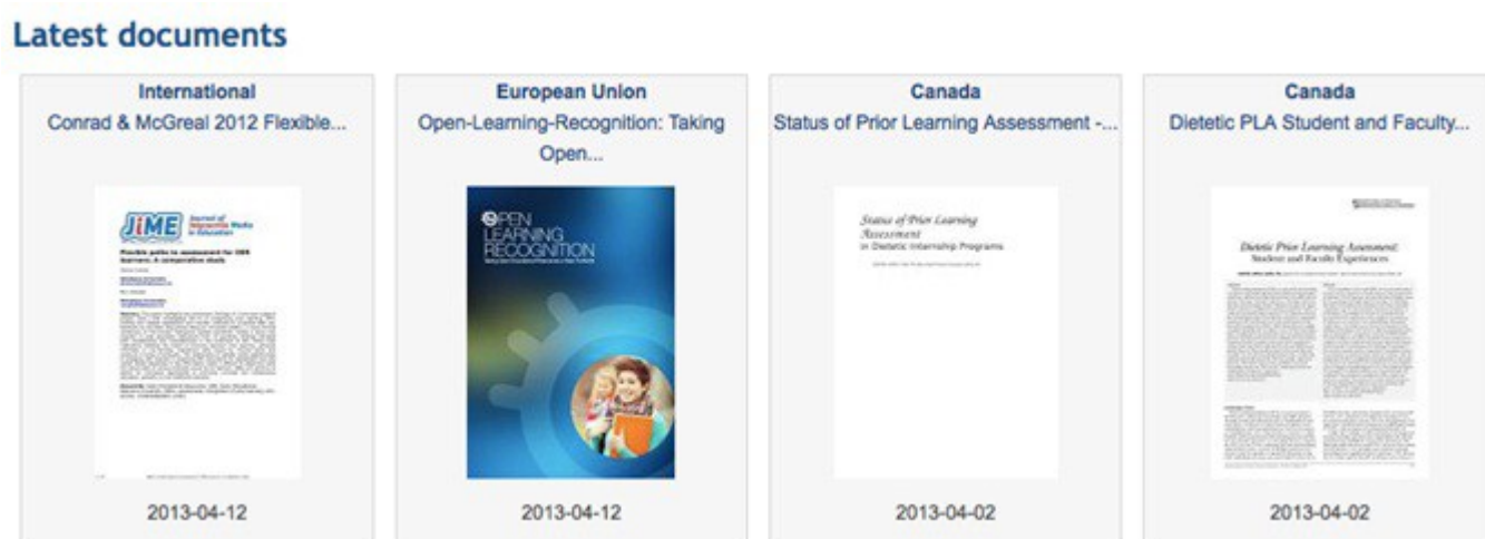
Figure 2. Latest documents, PLIRC database

Finally, we offer a more conventional search tool (Figure 3). Because the database only contains PLAR-related documents, search terms do not need to include the alphabet soup of acronyms for PLAR around the world. For example, you could just enter the term “open education,” and you would find two documents on this topic specifically related to PLAR: Flexible Paths to Assessment for OER Learners (Conrad & McGreal, 2012) and Open Learning Recognition: Taking Open Educational Resources a Step Further (Camilleri et al., 2012). These two documents bring us to the final feature of the PLIRC database.